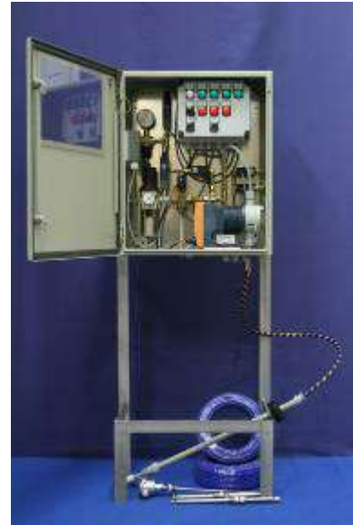
EGT-2, Temperature controlled on frame